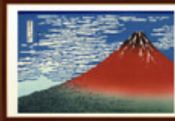
South Wind, C...