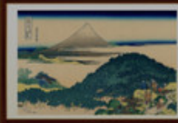
Cushion Pine a...