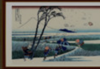
Ejiri in Suruga ...