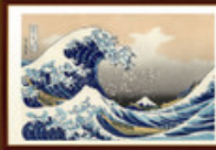
The Great Wav...