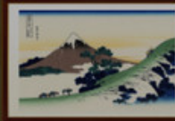
Inume Pass, Ko...