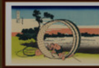
Fuji View Field...